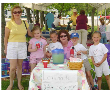
3 rd Annual Kids Day USA Sponsored by Parent Chiropractic