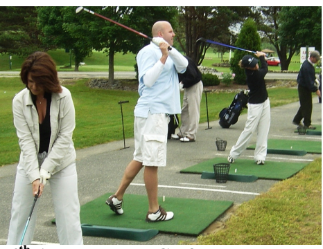
4<sup>th</sup> Annual DNH Golf Tournament Golfers drive to raise $11,000 for DNH