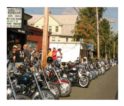
1st Annual Poker Run Sponsored by: Rumbleseat