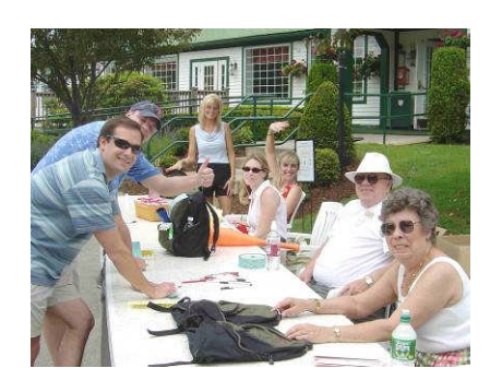
3<sup>rd</sup> Annual DNH Golf Classic At The Sheraton-Ferncroft Country Club